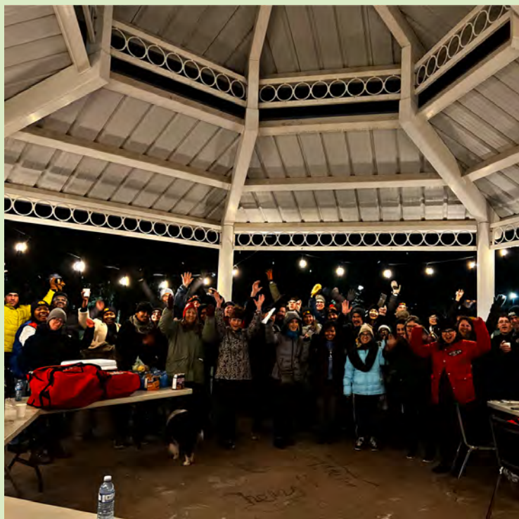
Campers and presenters gathered at MacDonald Park, December 8th 2023.