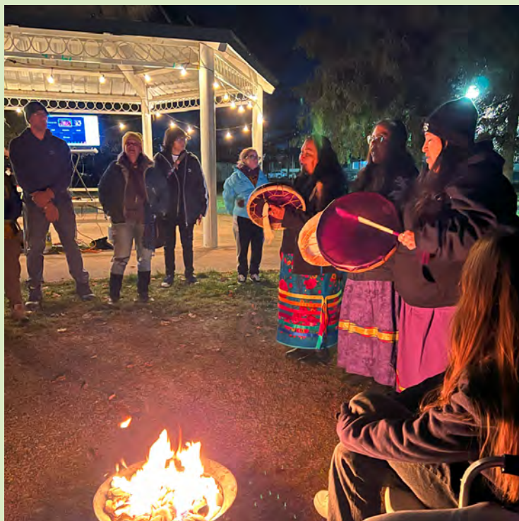
Kamloops Aboriginal Friendship Centre Drummers warm their drums by the fire and help start Campout in a good way.