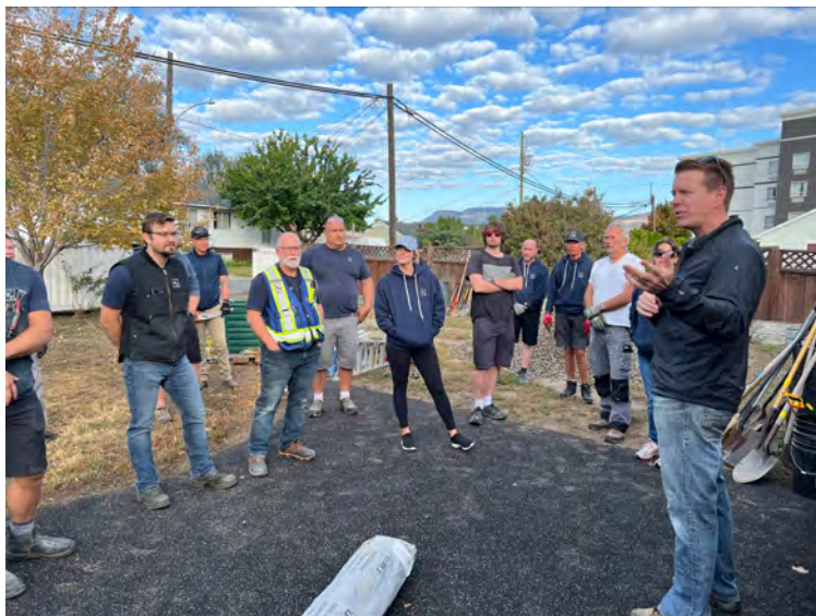
Kelson Group gathered a huge team of volunteers to help landscape one of the AWHK homes and made a big difference for AWHK, the youth, and the neighbors!