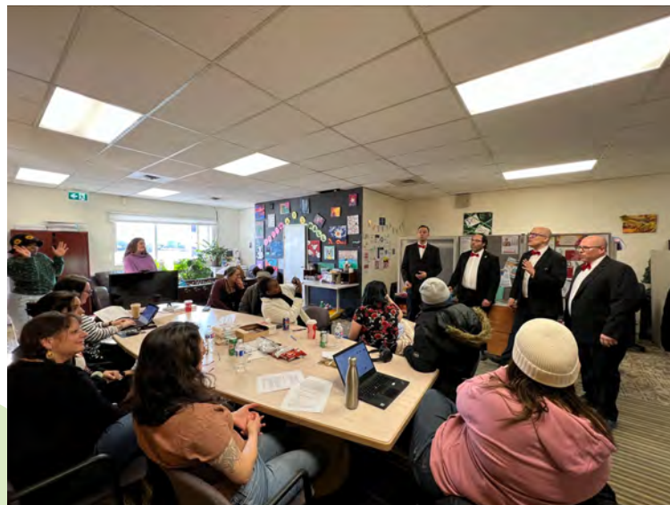
The talented acapella group Slow No Tempo share their gifts with AWHK staff and youth on Valentines Day 2023.